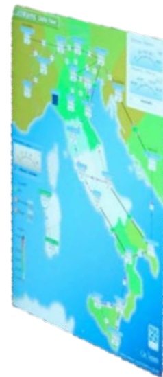
BESS in Italy